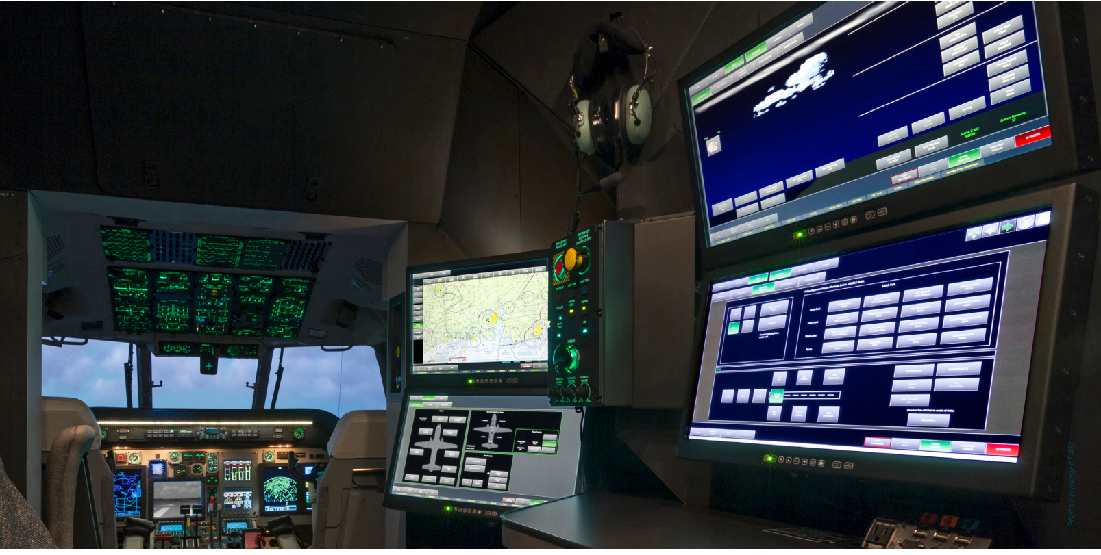
Four Saber Standalone 21.5 monitors ready for duty in a flight simulator