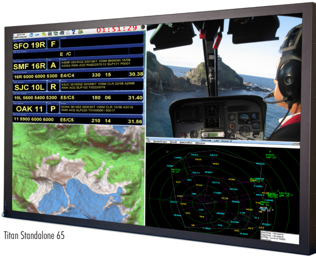
Titan Standalone 65

Large Format, Industrial-/Military-Grade, Standalone/Mountable LCD Monitors