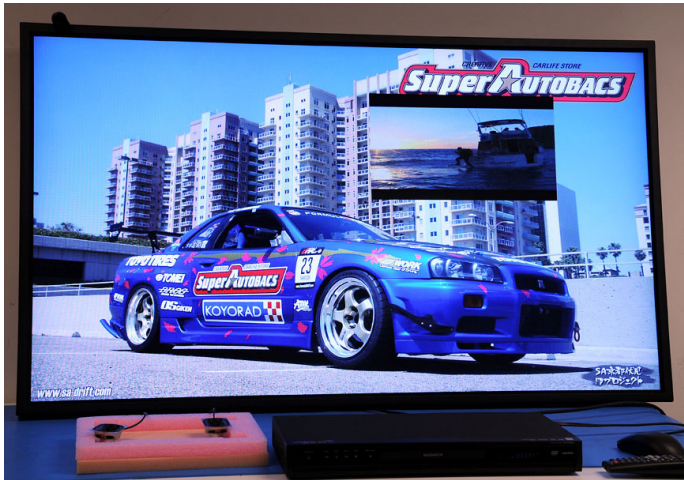
Titan Lite PanelMount 52 on Test Bench

Large Format, Light Industrial-/Commercial-Grade, Panel Mount LCD Monitors