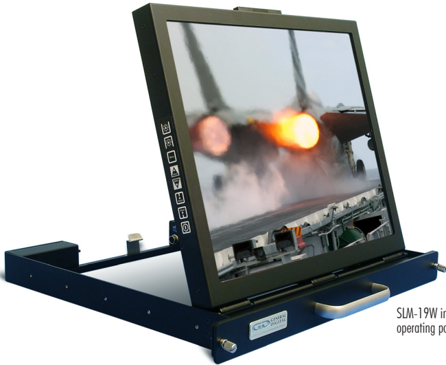
SLM-19W in operating position

Industrial-/Military-Grade, 1U Rack Mount, Standard/High Brightness, Flip-Up/-Down LCD Monitors