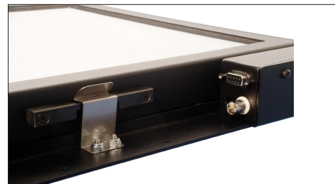
SlimLine Micro Retention Clip and Interface Connectors