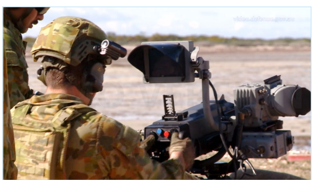
Mounted 6.5" Barracuda with optional rubber hood