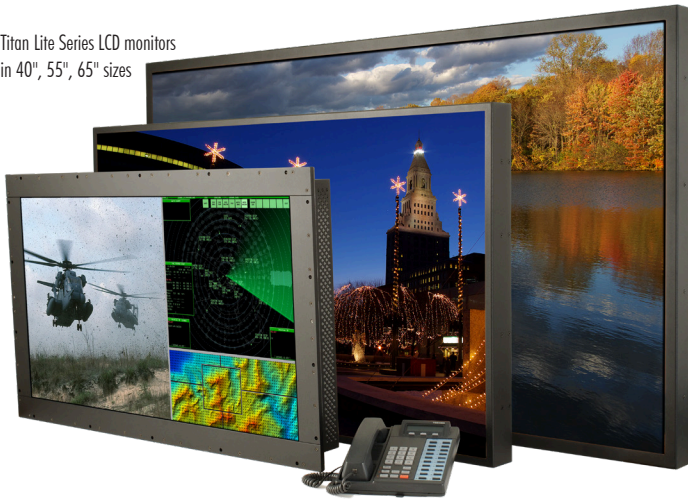
Titan Lite Series LCD monitors in 40", 55", 65" sizes

The TITAN LITE RACKMOUNT SERIES of LCD monitors satisfies the increased demands for information density: the need to include more graphical and contextual information in a given viewing space. These large size, wide format monitors are the perfect supplement to the conventional sizes offered in General Digital's venerable LCD product lineup.