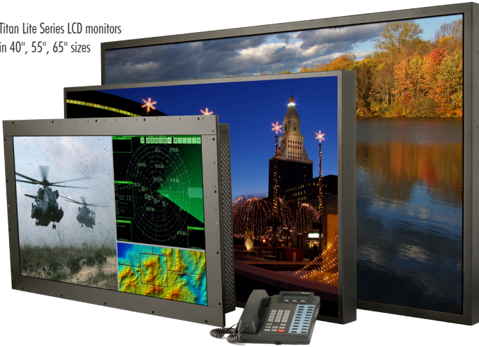
Titan Lite Series LCD monitors in 40", 55", 65" sizes

The TITAN LITE RACKMOUNT SERIES of LCD monitors satisfies the increased demands for information density: the need to include more graphical and contextual information in a given viewing space. These large size, wide format monitors are the perfect supplement to the conventional sizes offered in General Digital's venerable LCD product lineup.