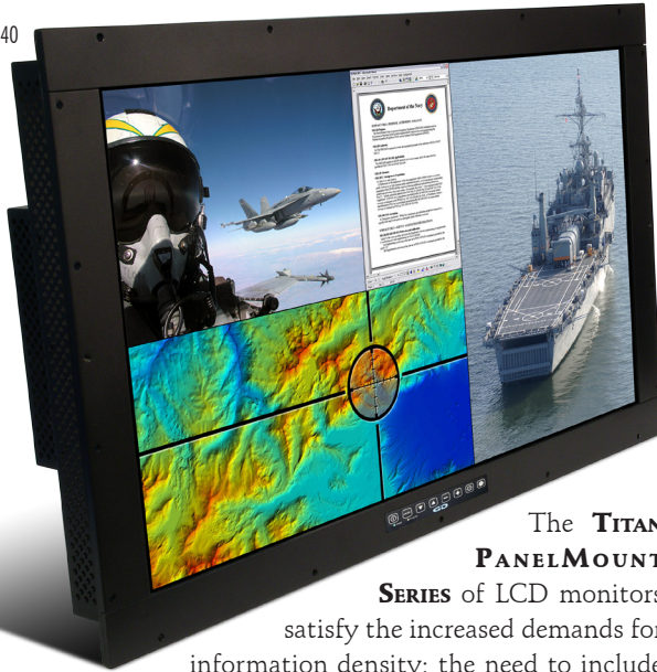
Titan PanelMount 40

Large Format, Industrial-/Military-Grade, Panel Mount LCD Monitors