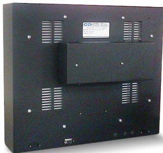
Rear View of Saber Standalone 19" shown with and without Rear Attached Power Supply