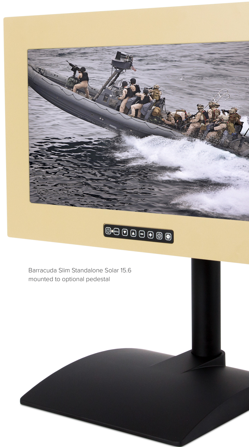
Barracuda Slim Standalone Solar 15.6 mounted to optional pedestal