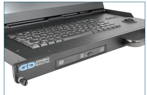
The SlimLine 1U Multimedia can be equipped with a CD, DVD or Blu-ray® drive

At only one rack unit high (1.75"), the compact design and industrial durability combine with General Digital's legendary configuration control and long product life cycles to create the ideal rack mount solution for network administration, telecommunications, mobile and tactical applications, and much more.